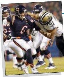
SAINTS PREVAIL — Sports, Page 1B